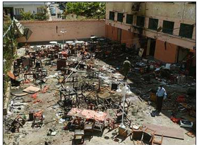
Casa de Espana