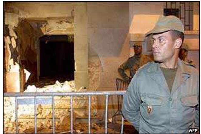
Jewish Community Center